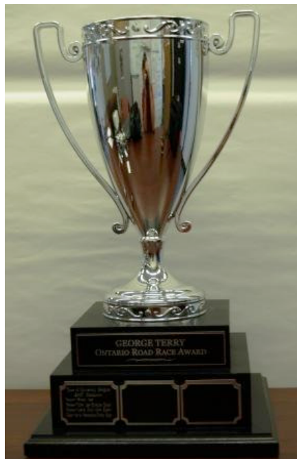
The George Terry Cup